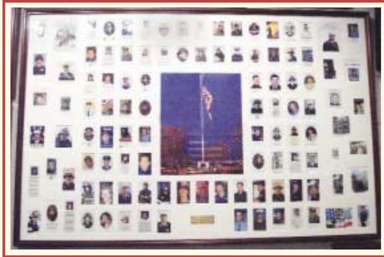
Photographs and remembrances as placed on California Memorial Monument the day of the memorial dedication, December 8, 2001. (Wall #7)