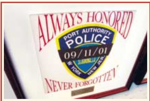
Actual sign from Port Authority Command Post at World Trade Center Ground Zero. (Wall #8)