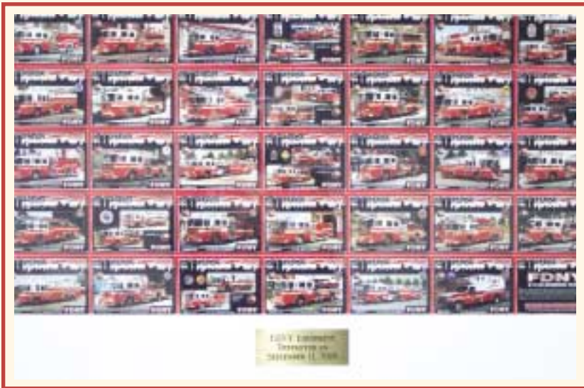
A collection of photographs representing all of the FDNY equipment destroyed on September 11, 2001. (Wall #3)