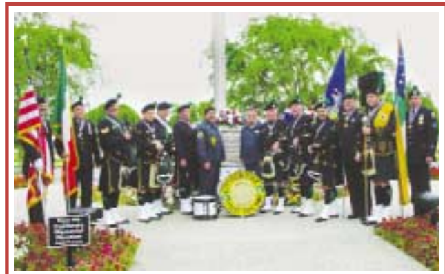
The NYPD Emerald Society Pipes and Drums Band helped celebrate the opening of the California Memorial Museum.