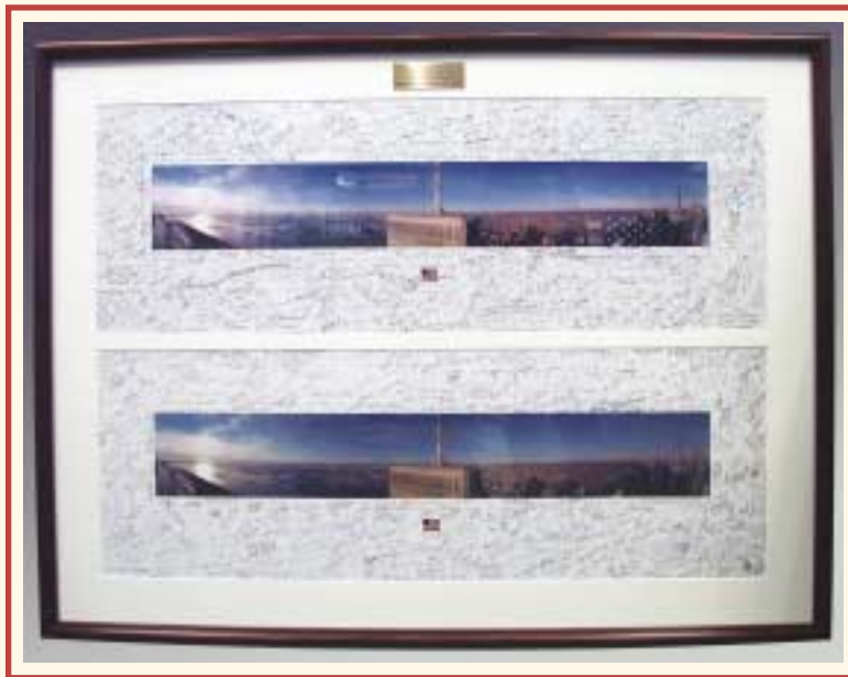
World Trade Center photographs signed by Fire and Police personnel who participated in World Trade Center rescue and recovery operations. (Wall #7)