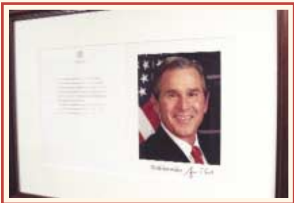
Words of appreciation to Pelco from President George W. Bush. (Wall #7)