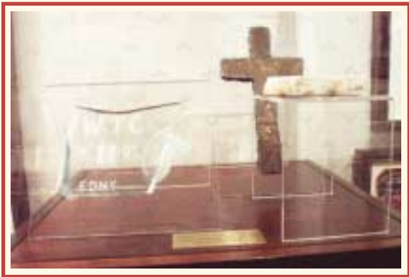
Steel, glass, marble and concrete fragments recovered from World Trade Center site — September, 2001. (Wall #7)