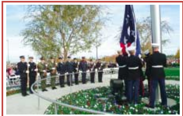
The December 8, 2001 dedication was very elaborate and formal. The US Marines, as well as New York and local Police and Fire, Honor and Color Guards participated in the ceremony.