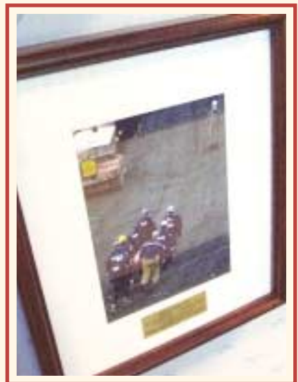
Photograph of the recovery of Port Authority K-9 Sirius, Badge #17. (Wall #8)