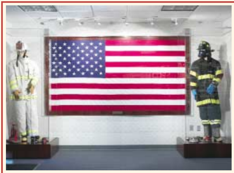
Actual Firefighter uniform worn during Ground Zero rescue operations (right). Firefighter uniform presented to David L. McDonald from City of Clovis Fire Department (left). Center – Actual American flag flown by FDNY Truck #10 on September 11, 2001 – during rescue and recovery operations. (Wall # 1)