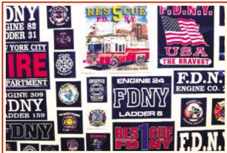
Collection of FDNY commemorative T-shirt art. (Wall #7)