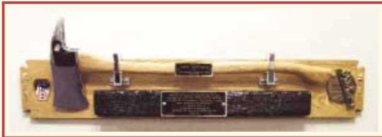
A very special gift ax from FDNY Officers and Firefighters of Engine Company #164 and Ladder Company #84. (Wall #6)