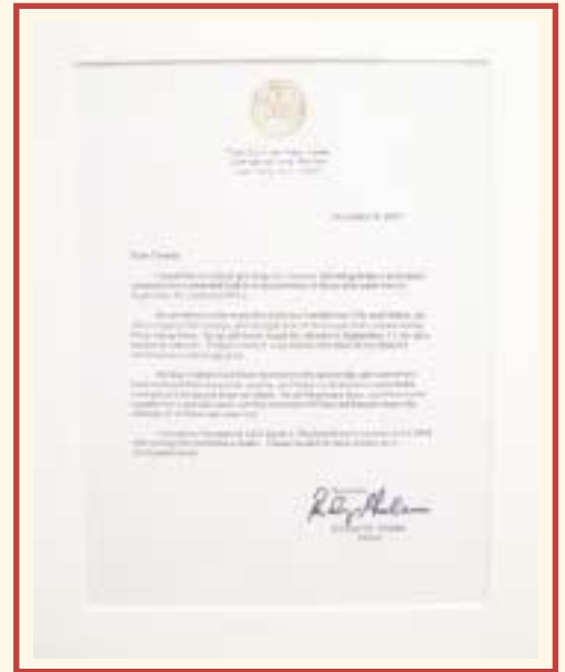
Words of appreciation to Pelco from the New York Mayor, Rudolph Guiliani. (Wall #7)