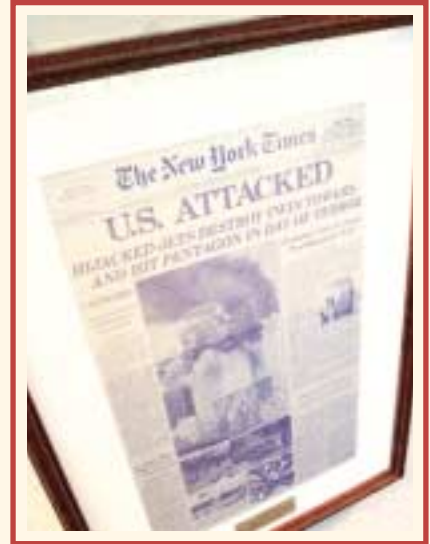
Original New York Times printing plate from September 12, 2001. (Wall #8)