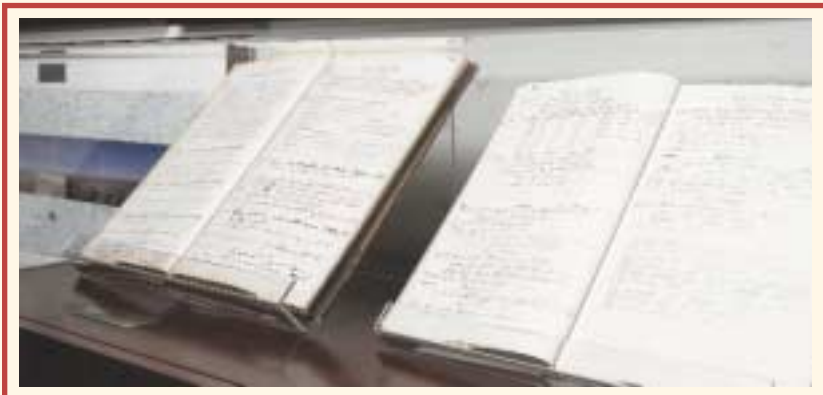
Official Log Book from FDNY #758, Hose Wagon #157 from April - October, 1920; and the Official Log Book from Fresno Fire Department Engine #3, Truck #2 from October - December 1953. (Wall #7)