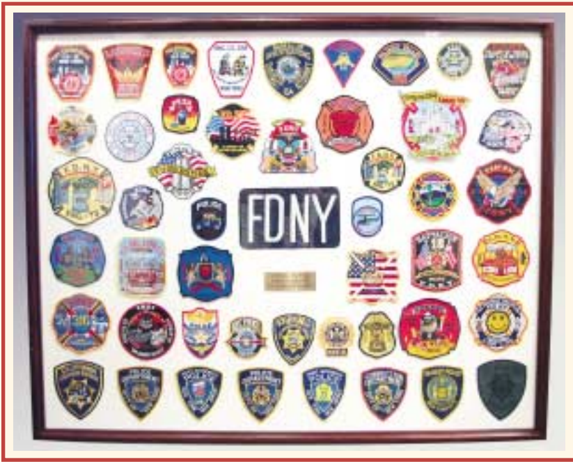
NYPD, FDNY, Port Authority, and Fresno/Clovis Officer Patches. (Wall #7)