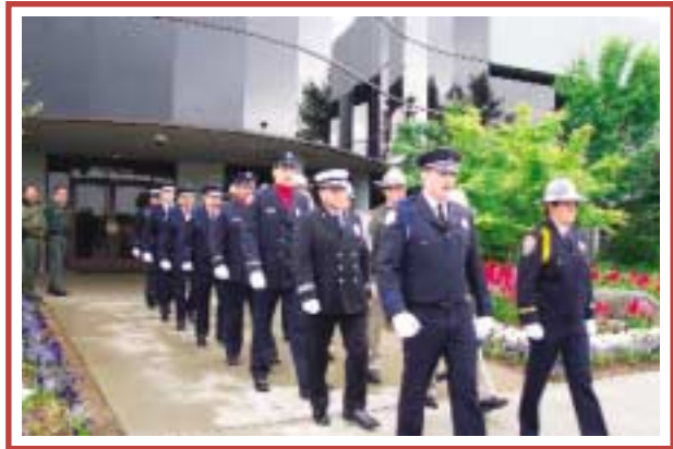
Fresno and Clovis area Fire and Police provided Color and Honor Guards for the ceremony.