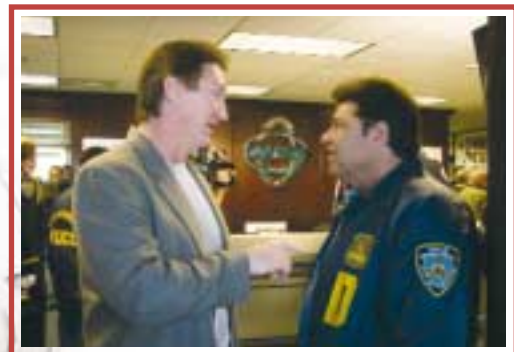
Mayor of Fresno, Alan Autry (left) was among the many visitors at the museum opening.